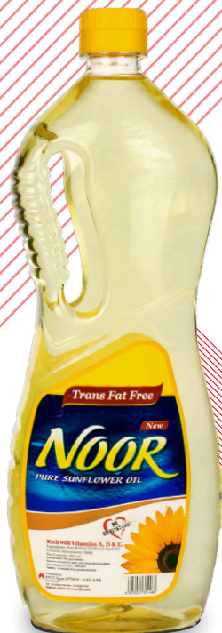
Noor S.F 6 x 850 ml PET Gross Weight: 5.079 kg Net Weight: 4.662 kg

Noor originated in 1985 with the launch of Noor Sunflower oil and was the first brand in Middle East to introduce trans-fat cooking oils. Since then we are passionate about helping families enjoy healthy and tasty meals.