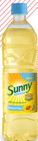
Sunny Sunflower Oil 12x700 ml PET Gross Weight: 8.206 kg Net Weight: 7.677 kg

Sunny Sunflower Oil is a truly multinational brand resonating with different demographics in different countries.