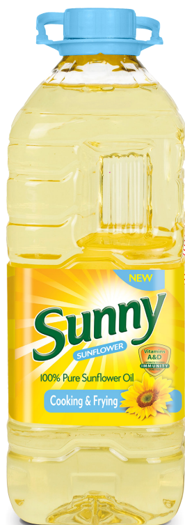
Sunny Sunflower Oil 4 x 2.4 lt PET Gross Weight: 9.341 kg Net Weight: 8.774 kg