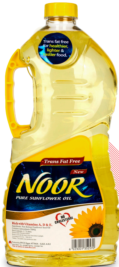
Noor S.F 4 x 2.65 L PET Gross Weight: 10.461 kg Net Weight: 9.689 kg