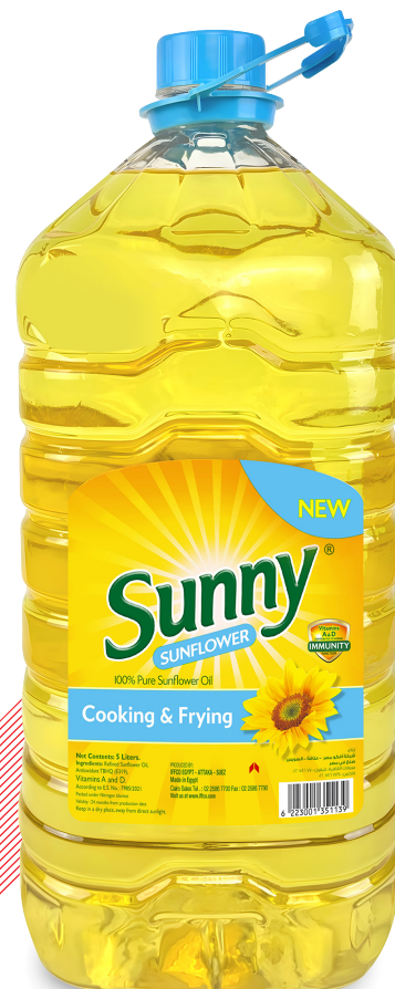
Sunny Sunflower 4 x 5 lt PET Gross Weight: 19.336 kg Net Weight: 18.28 kg