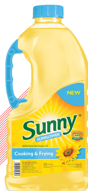
Sunny Sunflower Oil 4 x 1.5 L PET Gross Weight: 6.062 kg Net Weight: 5.484 kg