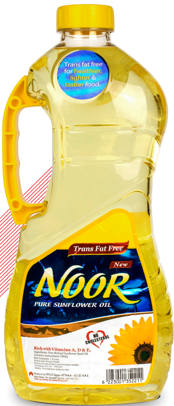
Noor S.F 4 x 1.75 Lt Gross Weight: 6.998 kg Net Weight: 6.398 kg